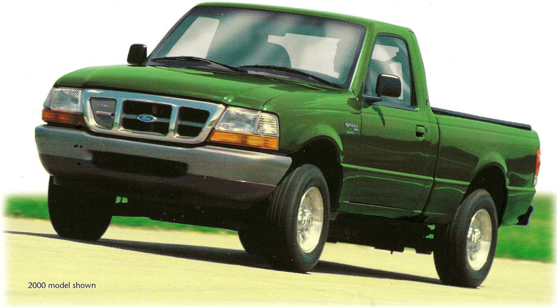
2000 model shown

AFV version of North America's Best-Selling Compact Pickup Truck!